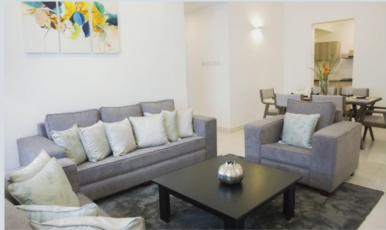
Actual image of interior