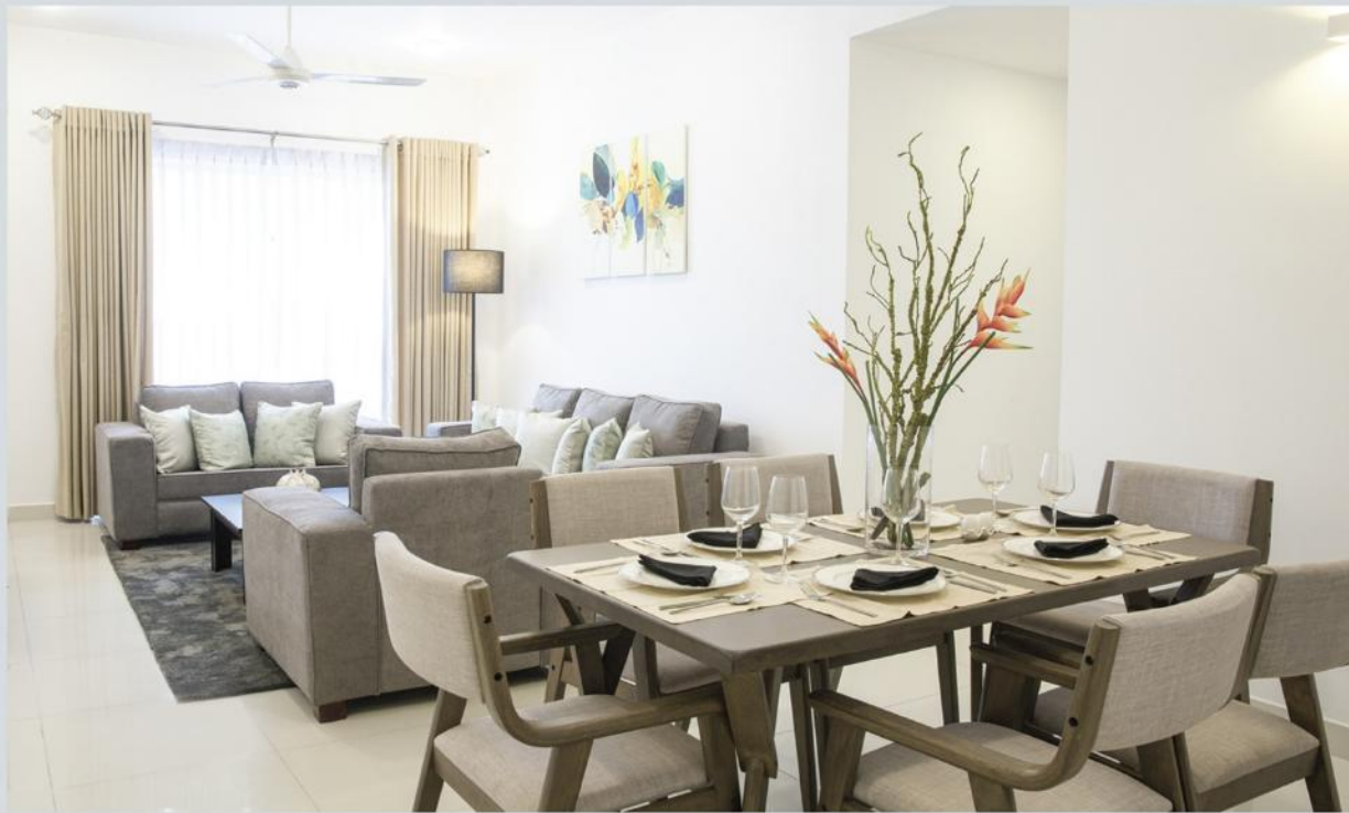
Actual image of interior

An interior where well-crafted design meets enviable lifestyles