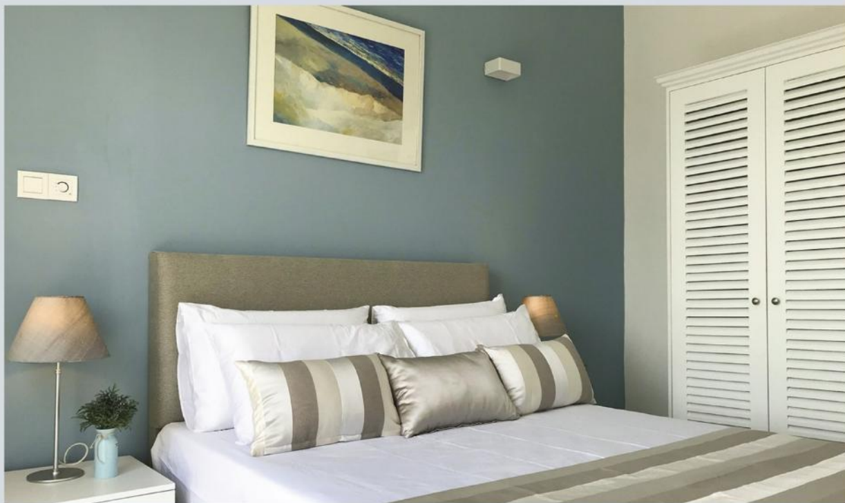
Actual image of interior

Bedrooms with simplicity for a welcoming retreat