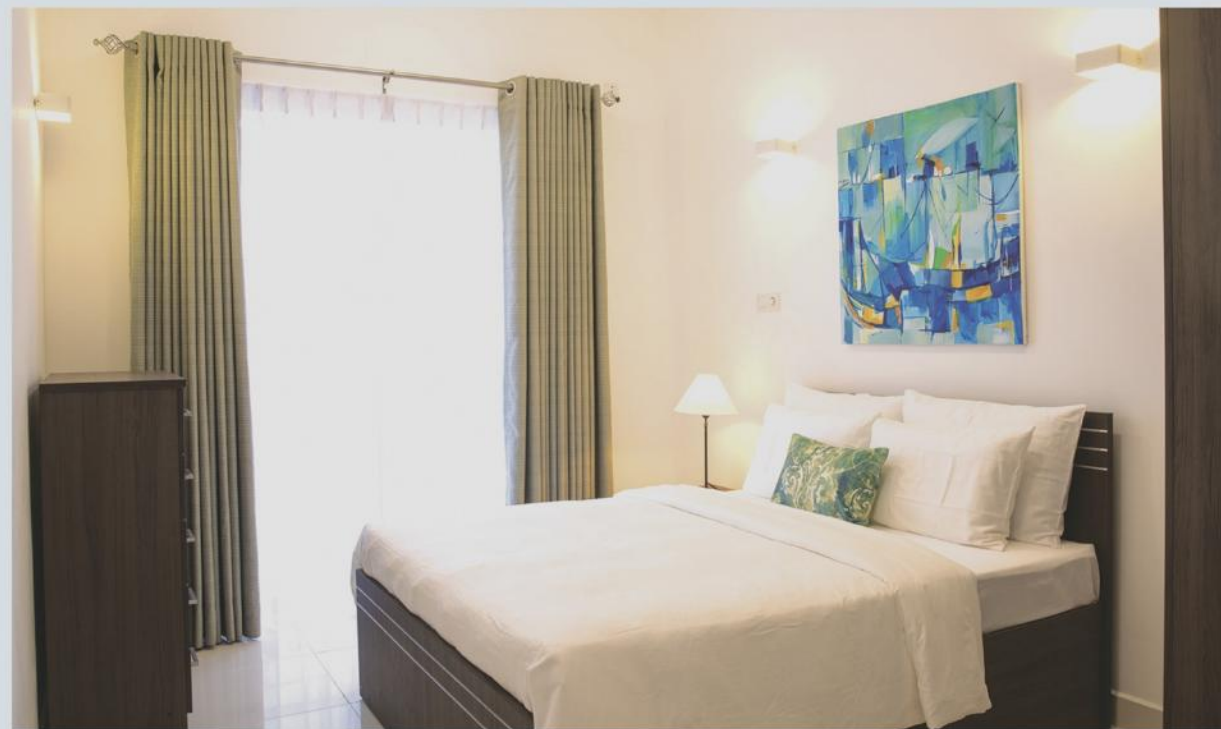
Actual image of interior

Bedrooms with simplicity for a welcoming retreat