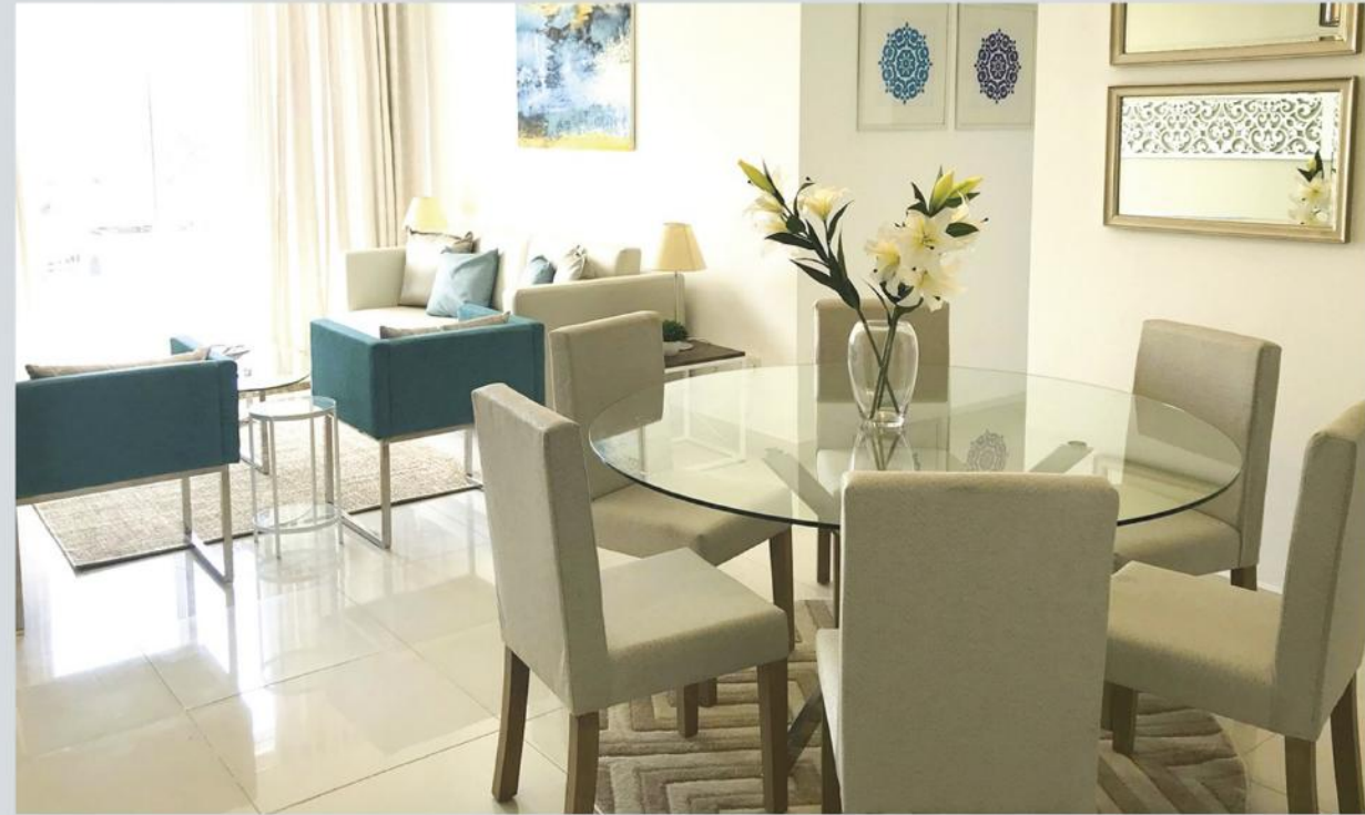
Actual image of interior