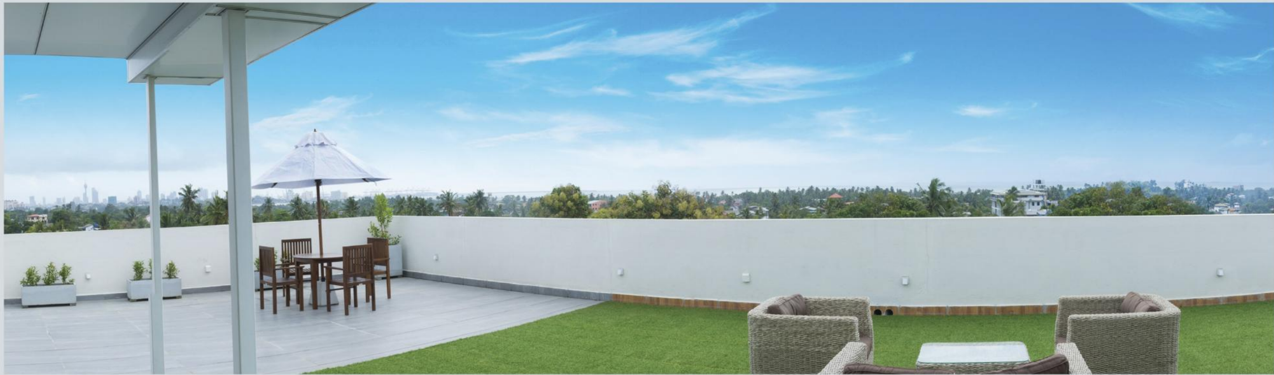
Actual image of rooftop