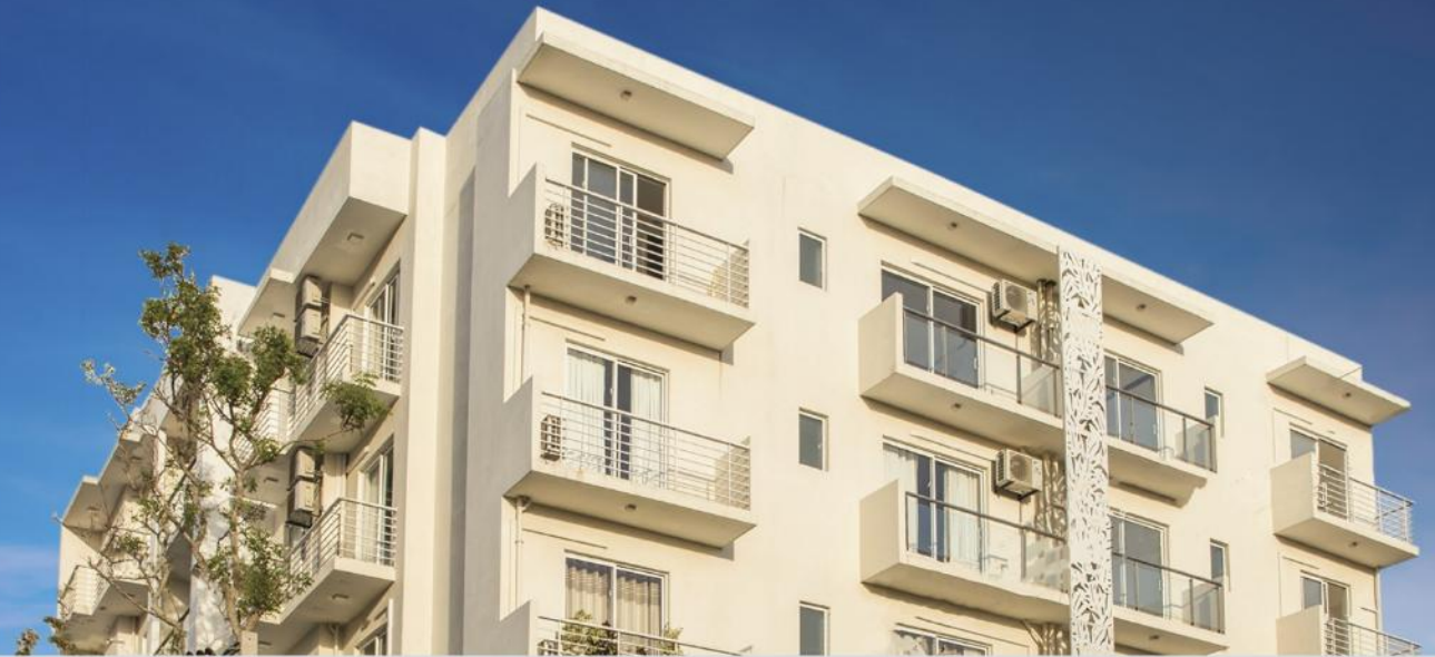
Actual image of exterior

A home experience of awe and wonder is showcased brilliantly within the façade of the exterior of the apartment building.