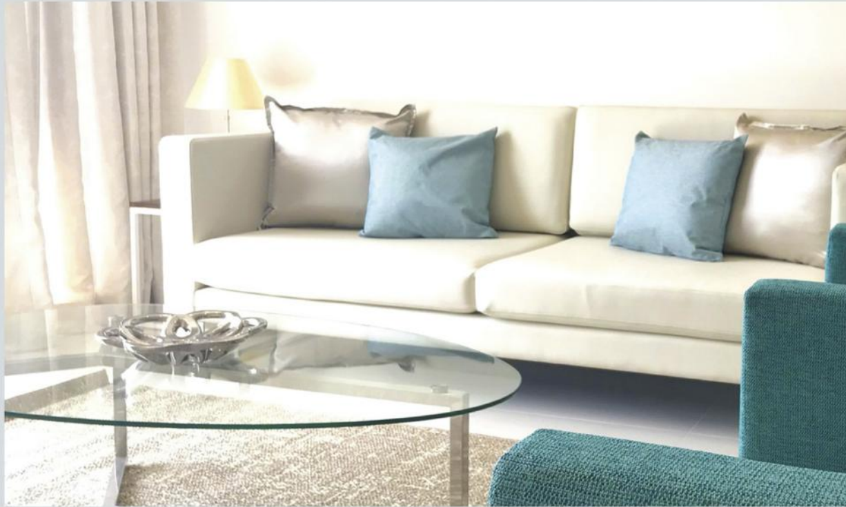
Actual image of interior